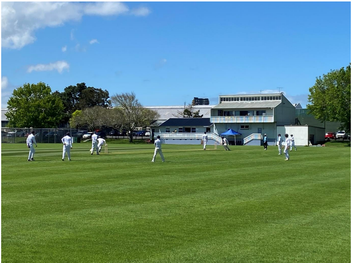
Premer Reserves – playing at Ken Maunder Park