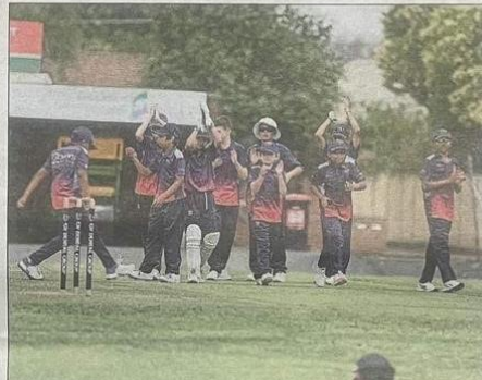
Sportsmanship: Suburbs New Lynn clap off a Cricket Shepparton opponent.