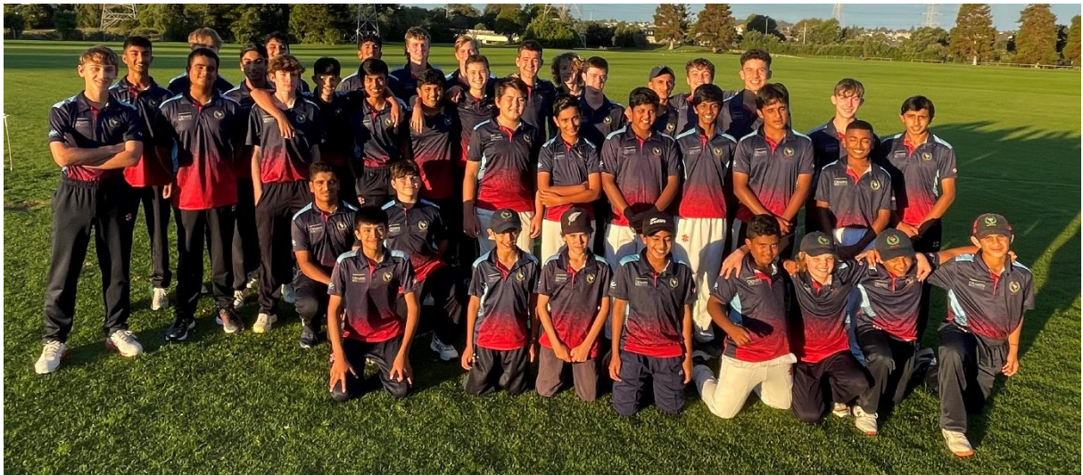
Three team tour to Melbourne