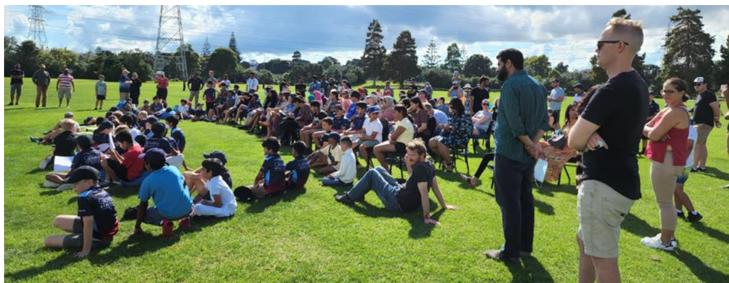
New Outdoor Format Junior Prizegiving