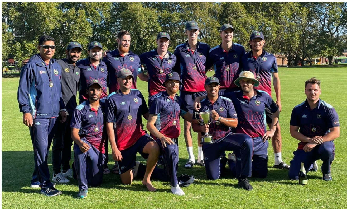
Premier Team, winners of the Richard Jones One Day Championship