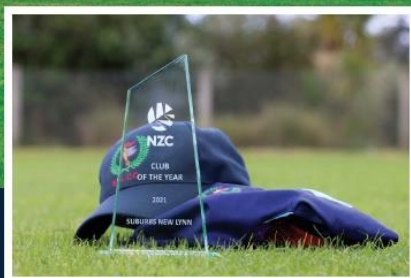
NZC Cricket Club of the Year 2021