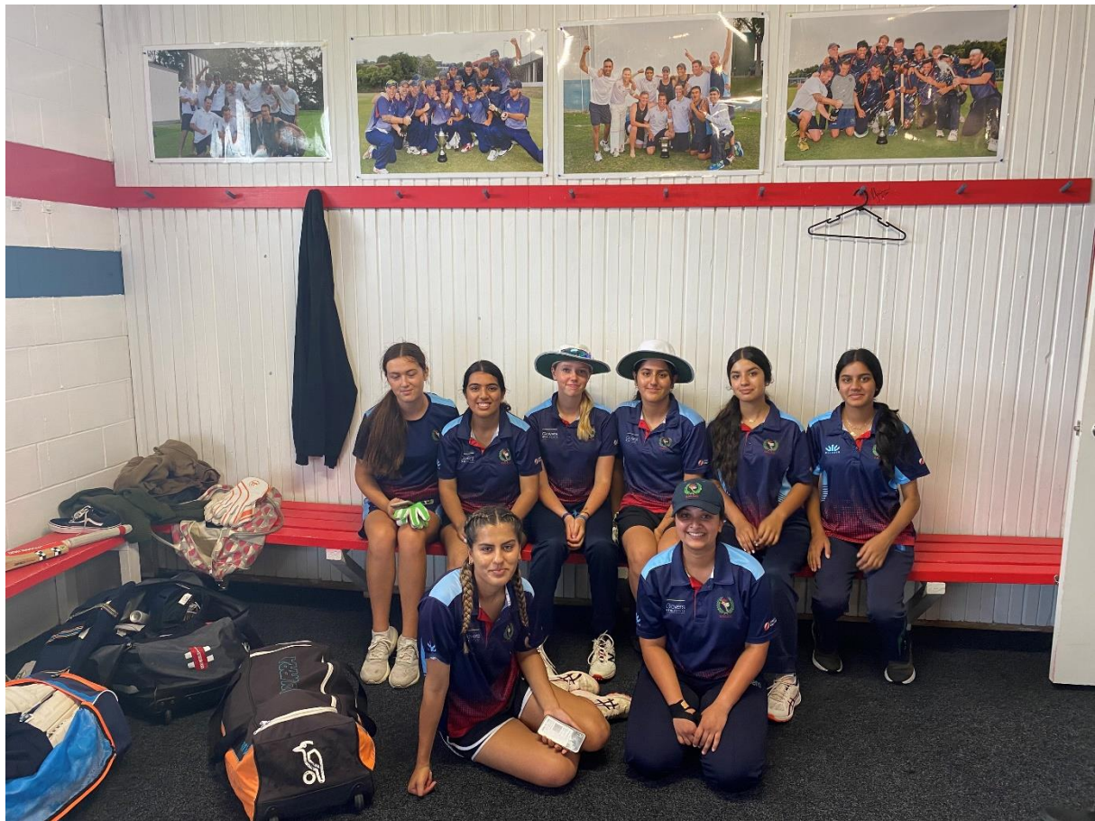
Using the Premier Changing Rooms for the first time as the Prem Reserve Women played on the number 1 at Ken Maunder Park